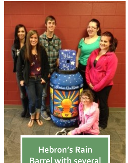
Hebron's Rain Barrel with several of the artists.